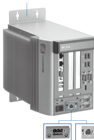
Phoenix plug for DC version