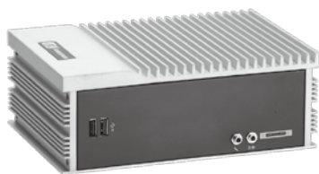
◀ Front view